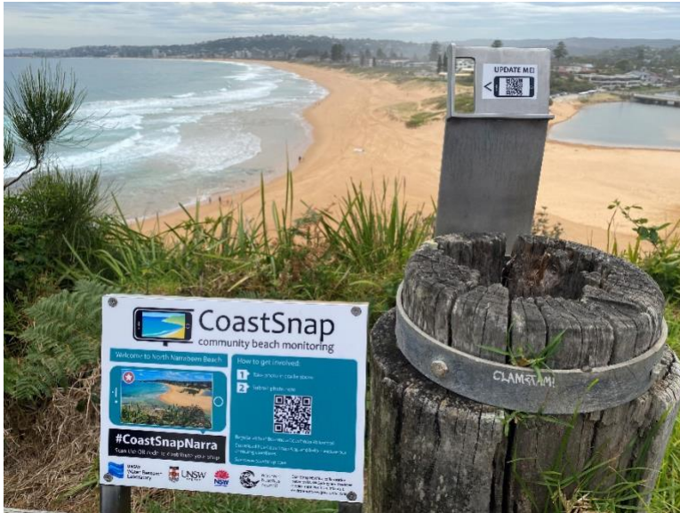
Figure 3: CoastSnap monitoring location at North Narrabeen Beach in New South Wales, Australia including the geo-referenced phone stand and educational display.