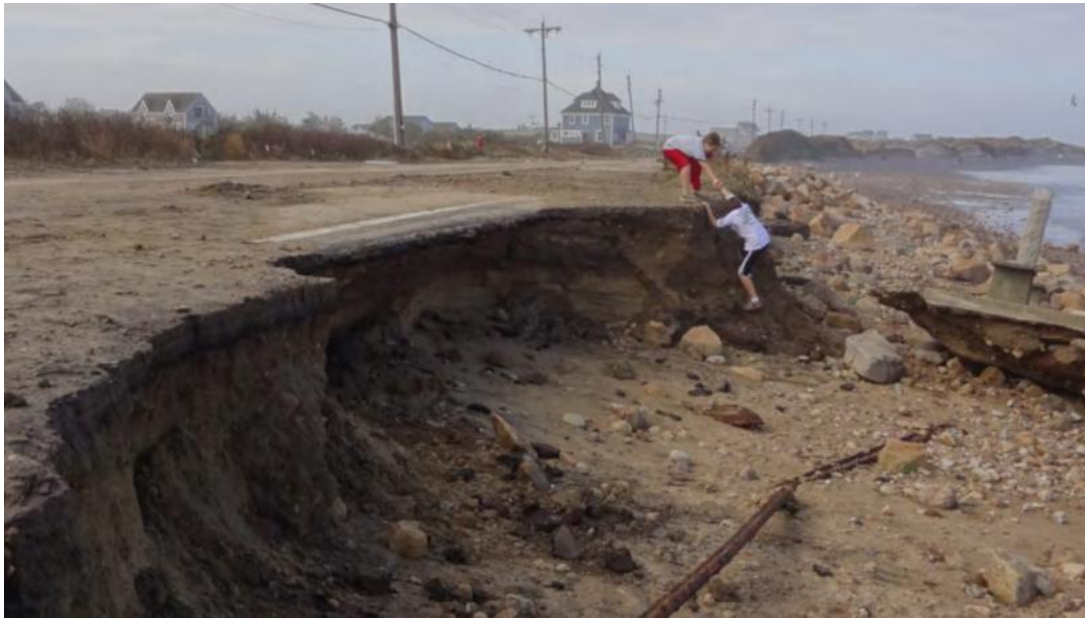
Figure 4: Corn Neck Road after Sandy (2012) (Block Island Time, 2012)